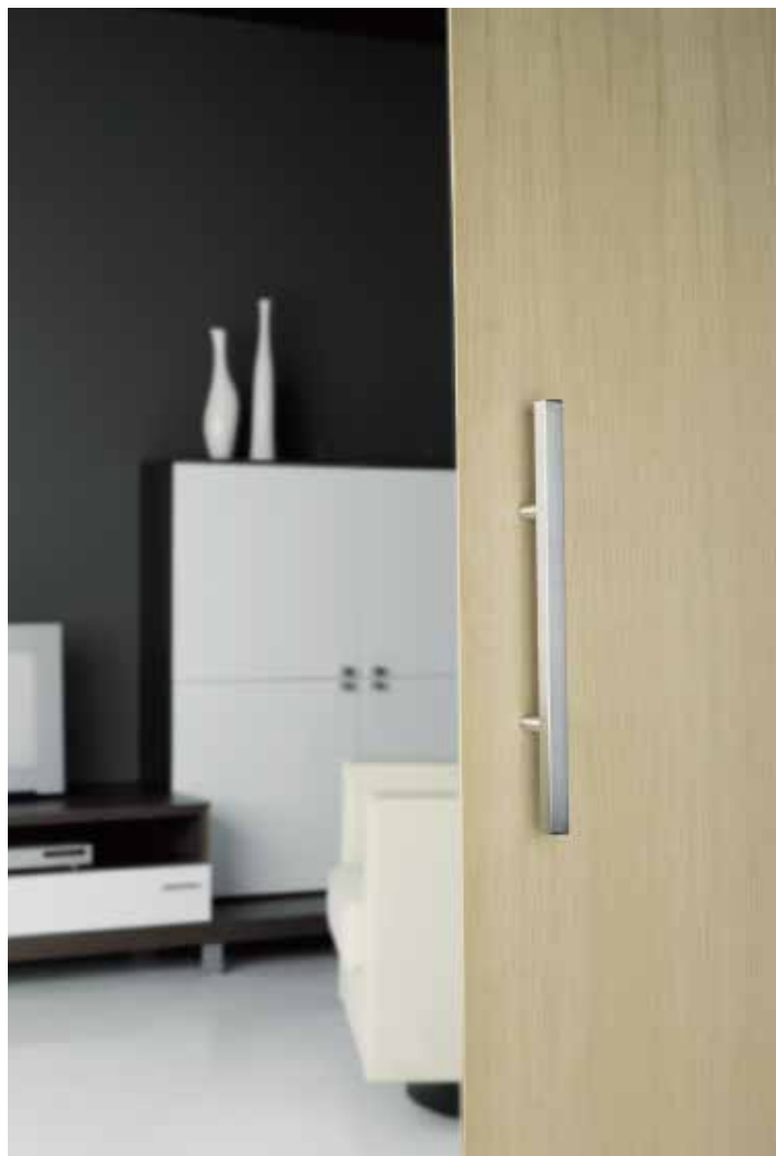
Matching cabinet pull - page 22